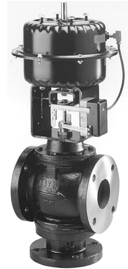
V-9502 Positioner Installed on a Rubber Diaphragm Type Valve Actuator

The starting point is the input pressure (Pilot P pressure) at which the actuator just begins to stroke. The starting point is field adjustable from 2 psig to 12 psig (14 kPa to 83 kPa) using the starting point adjusting screw located under the V-9502 Positioner cover. Turning the screw clockwise decreases the starting point, and turning the screw counterclockwise increases the starting point.